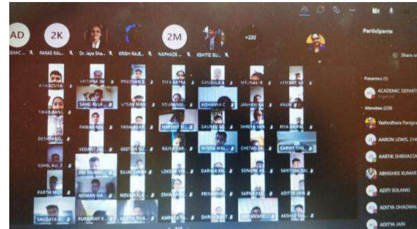
Cultural Awareness Online – Traditional Food of Chhattisgarh (Pic 2)