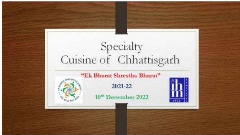
Cultural Awareness Online – Traditional Food of Chhattisgarh (Pic 1)